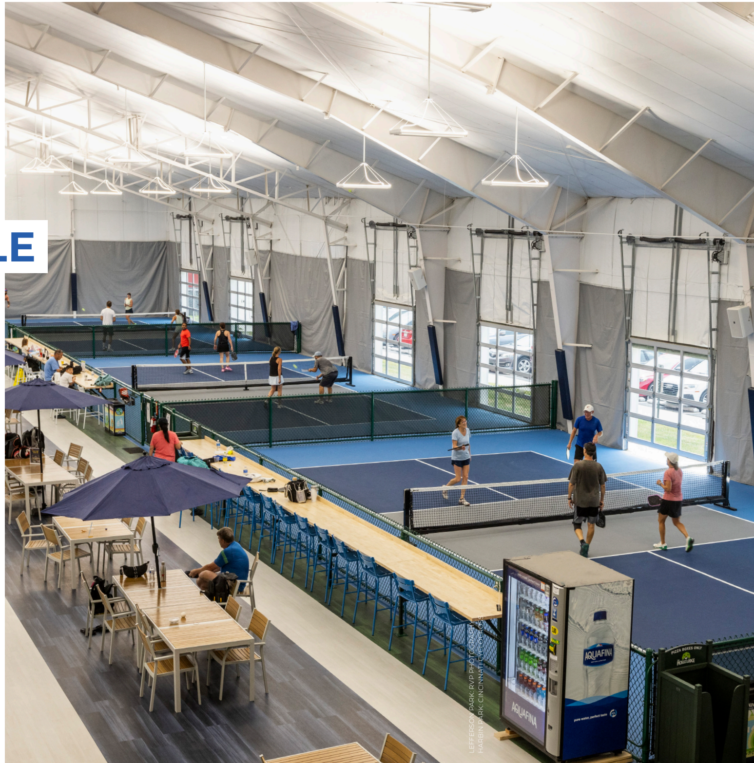
LEFFERSON PARK: RVP PHOTOGRAPHY HARBIN PARK: CINCINNATI CYCLOCROSS