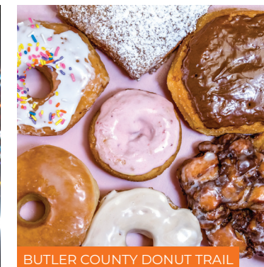
BUTLER COUNTY DONUT TRAIL