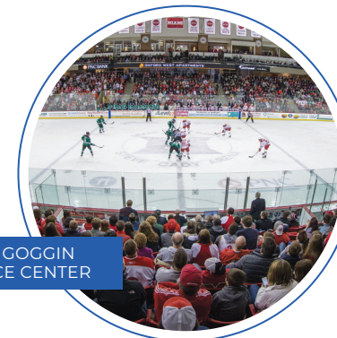
GOGGIN ICE CENTER