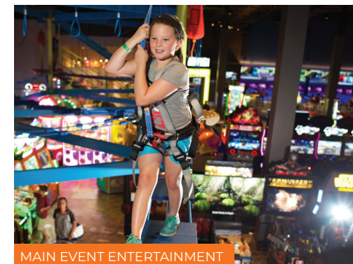
MAIN EVENT ENTERTAINMENT